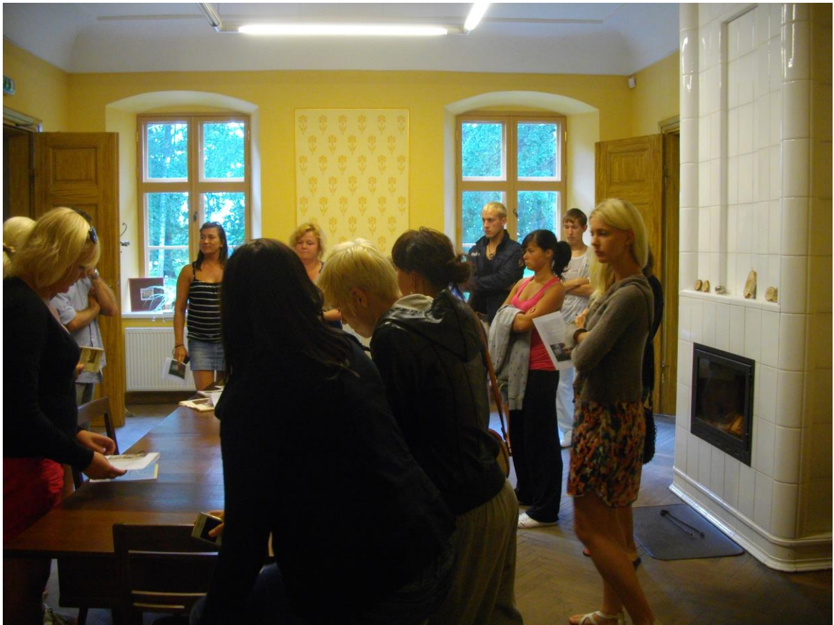
Visitors of the Forgotten Manors visiting game 2012 at Tammistu