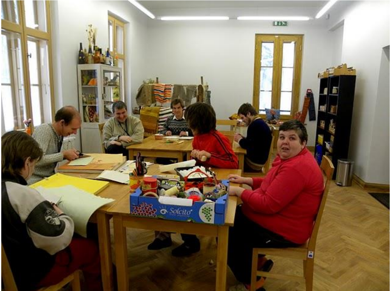
Textile workshop opened in 2009

Since 2008 when the first phase of employment service was started at Tammistu, numbers of users have increased, as well employees have been added to guide the work. In 2010 a study-kitchen with catering possibilities added strength to the task, the food consumed is now prepared at Tammistu.