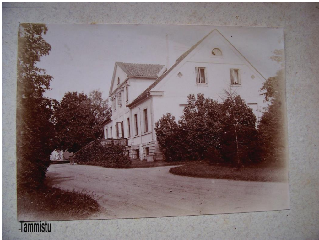
Tammistu manor before the WWII

October 5th 2007 HM Silvia Queen of Sweden visited Tammistu and put a symbolic corner-stone for the development of the center end as a sign of support for the Estonian Agrenska Foundation. Mrs. Evelin Ilves, whos patronage the Foundation enjoys accompanied the Queen. Queen Silvia have been the supporter of the Swedish Ågrenska family center since its establishing in 1989 and is supporting the center in Tammistu.