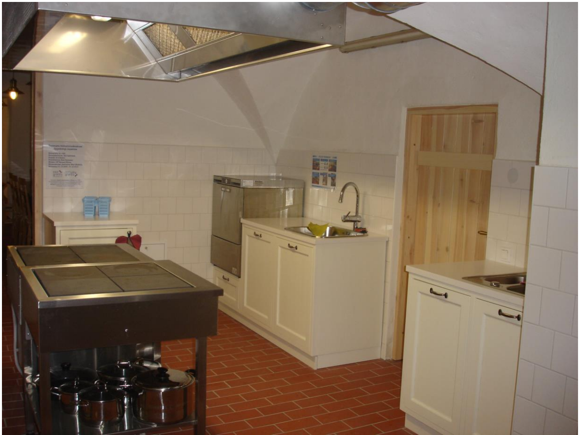
Tammistu manor kitchen was ready in 2010, financed by Norwegian EEA regional development grant